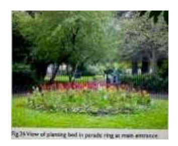
Howley Hayes Conservation Architects photograph from 2013

Howley Hayes Conservation Architects photograph from 2013 There were 7 planted flower beds and now only 1 remains. This constant attrition of the historic features of the Park is lamentable.